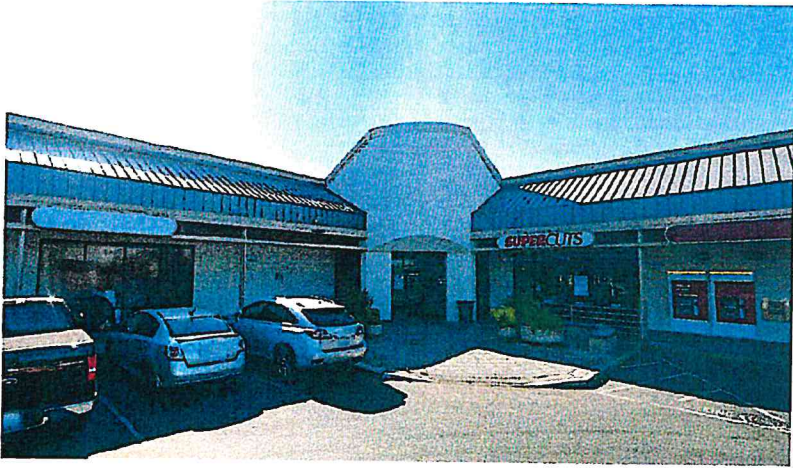
VIEW OF EXISTING FACADE CONDITION HTS