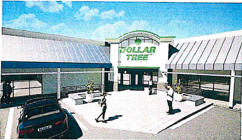
VIEW OF PROPOSED FACADE CONDITION HTS