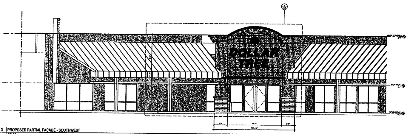
3 | PROPOSED PARTIAL FACADE - SOUTHWEST

onyx | creativ 12345 MAIN STREET, SUITE 100 TUNNICLIFFE, CA 94588 TEL: 925.464.1100 WWW.OXYXCREATIV.COM