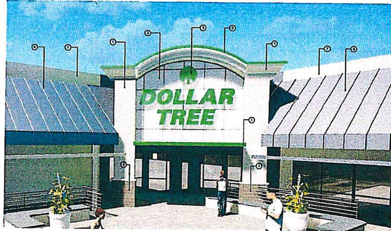
2 | PROPOSED FACADE ELEVATION AND FINISHES HTS