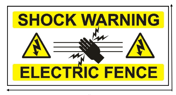
36 sq" Min

Compliance with all laws and regulations. The electrified fence shall meet all California Building Code, California Fire Code, Fire Department, and Police Department requirements, as well as all applicable federal, State, and local laws throughout the construction, installation and operation of the electrified fence.